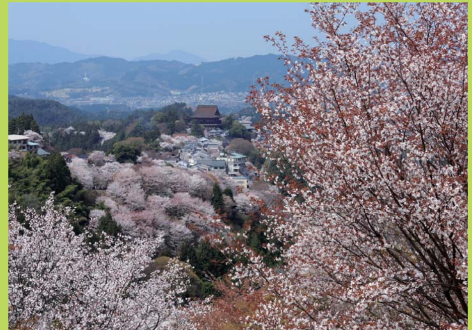
Japan is presently enveloped in a thick, even dangerous, fog, which is obscuring the way forward. It is for this reason that we present these studies, incomplete though they may be, with some content that is still evolving. We need insights that can light our path like a lantern in a wilderness. In Nara, the original archetype that begot the Japan we know today still remains, and may shed light on contemporary issues we face.